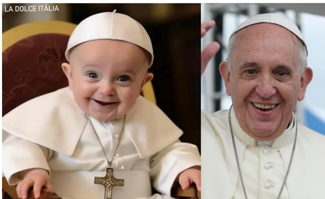
Maybe this little man will be pope one day ❤️